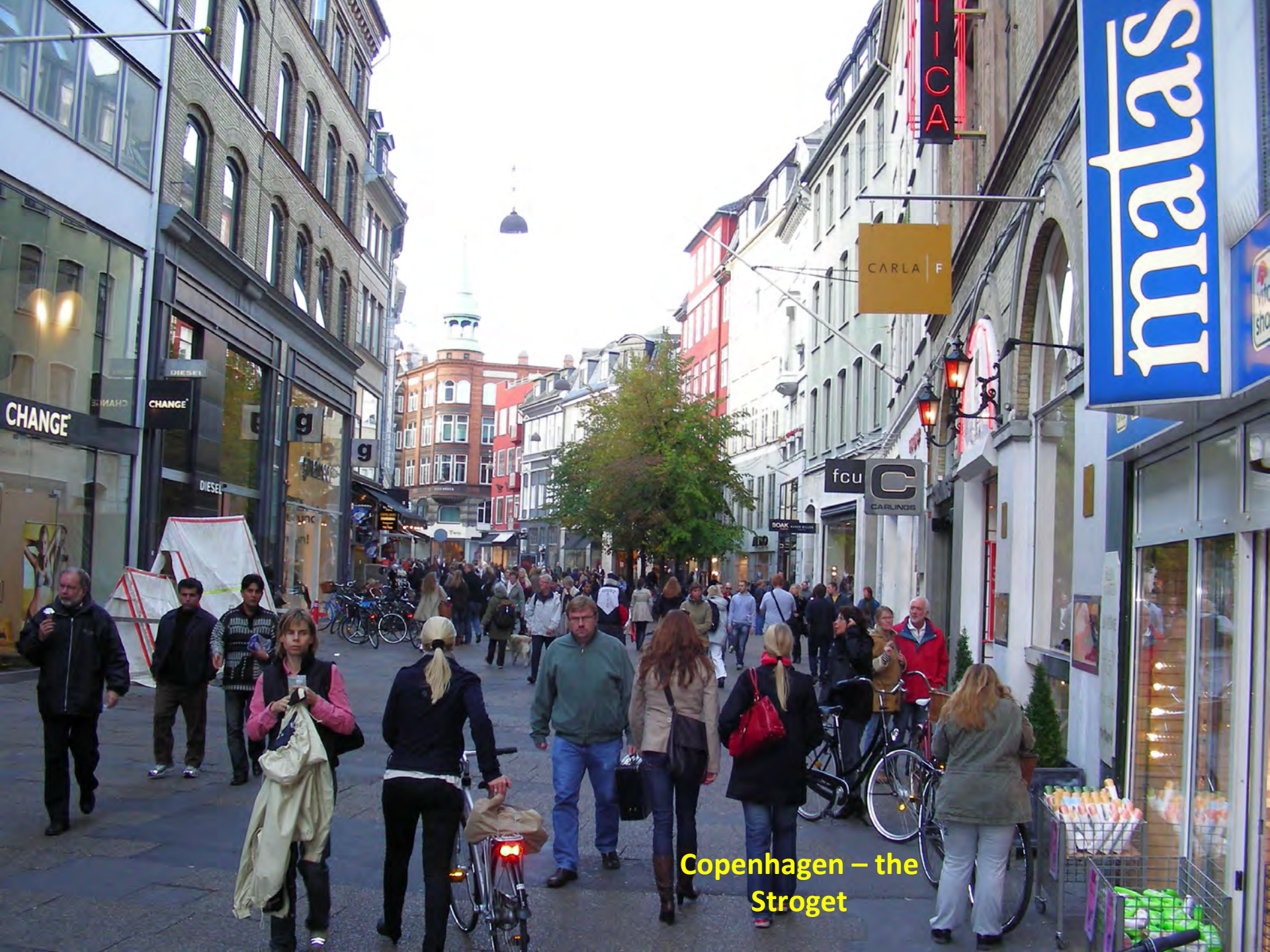
Copenhagen – the Stroget