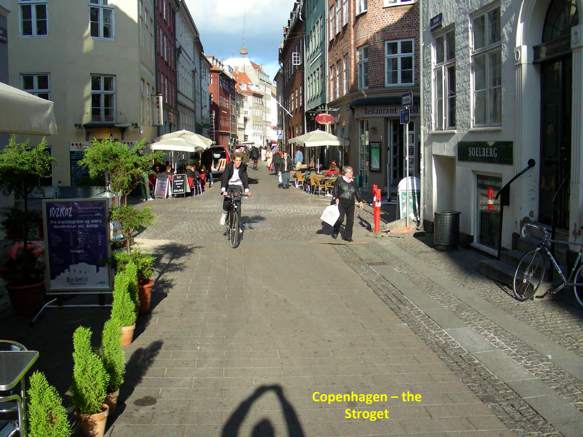
Copenhagen – the Stroget