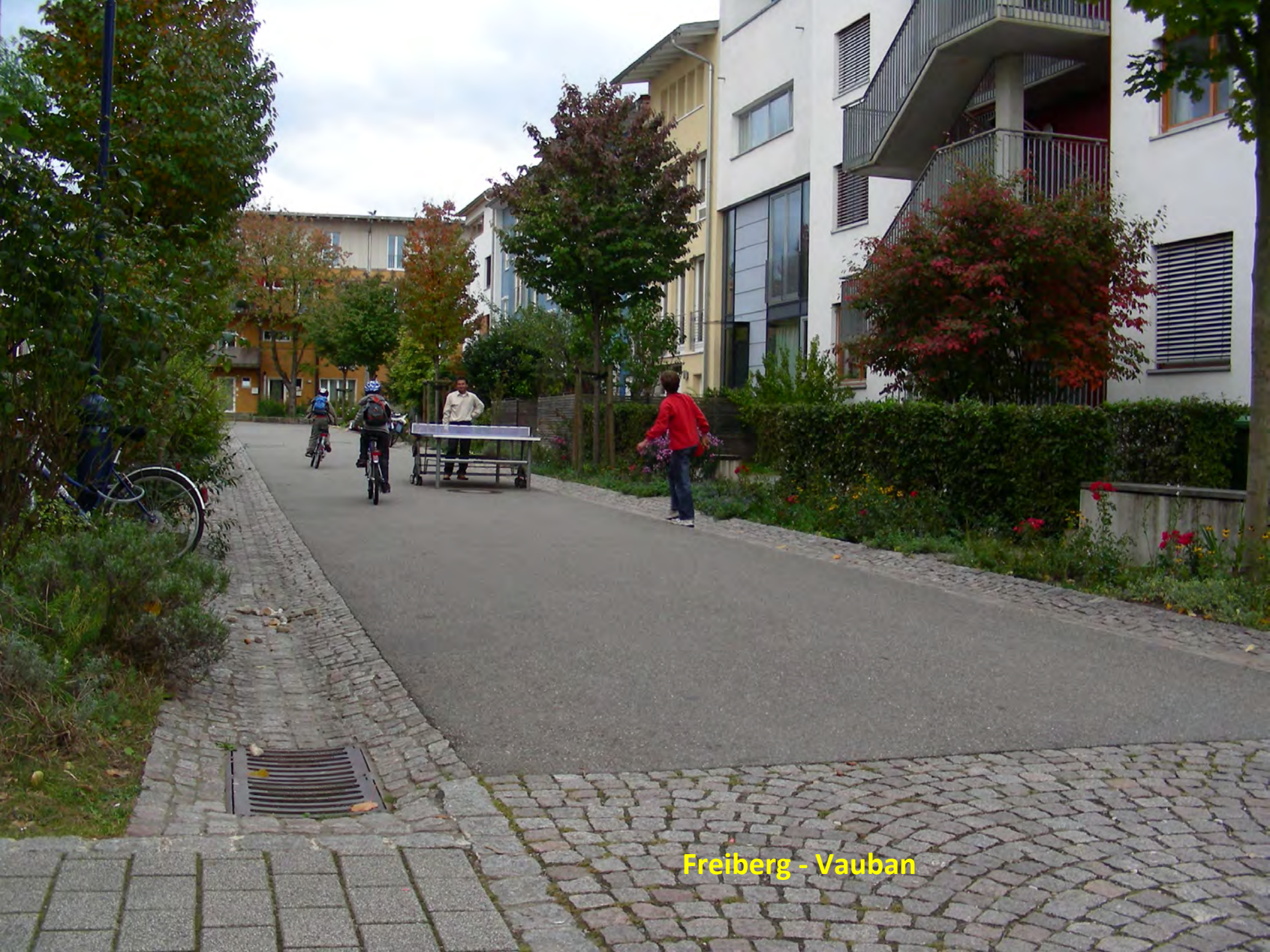
Freiberg - Vauban