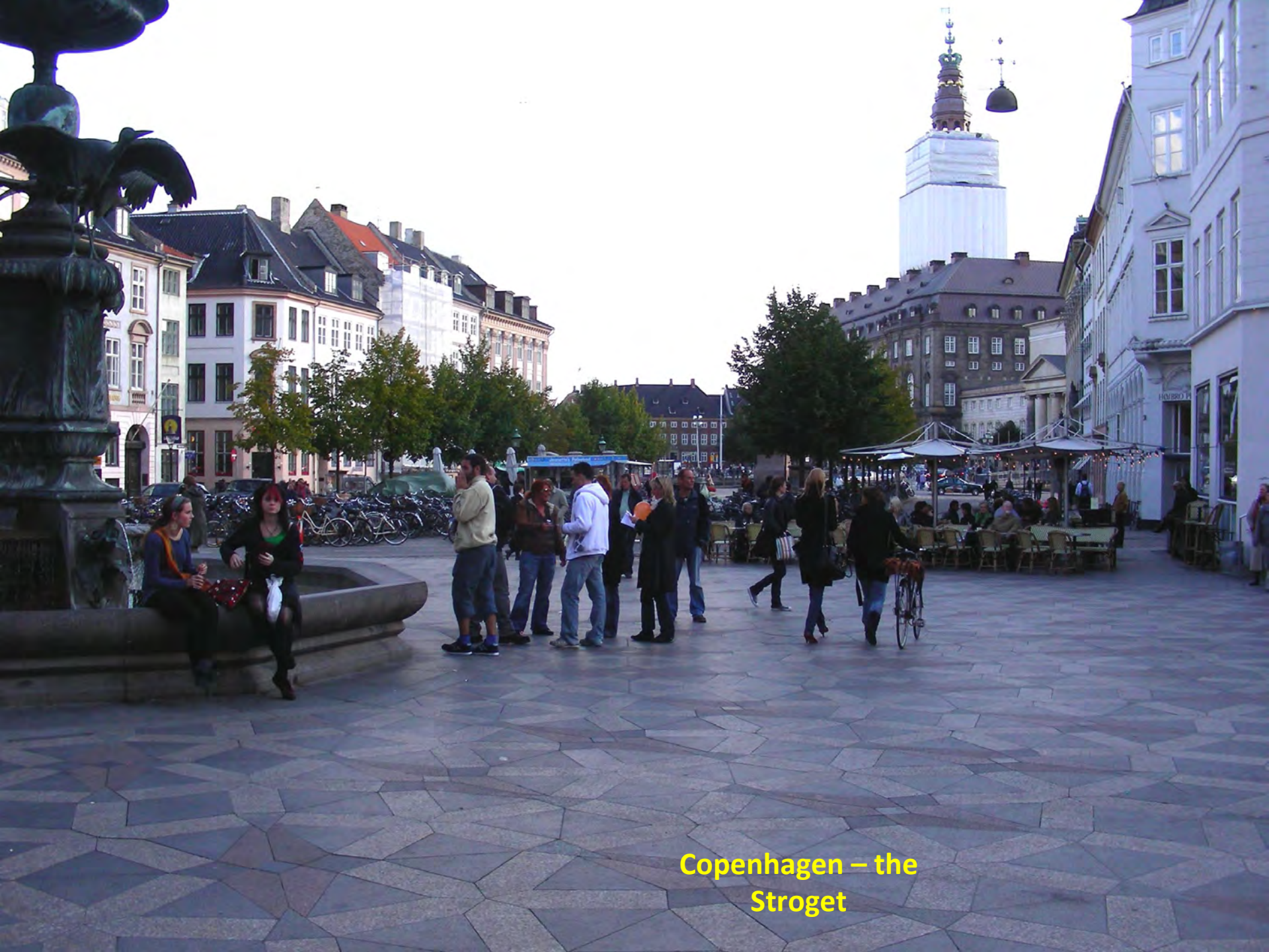
Copenhagen – the Stroget