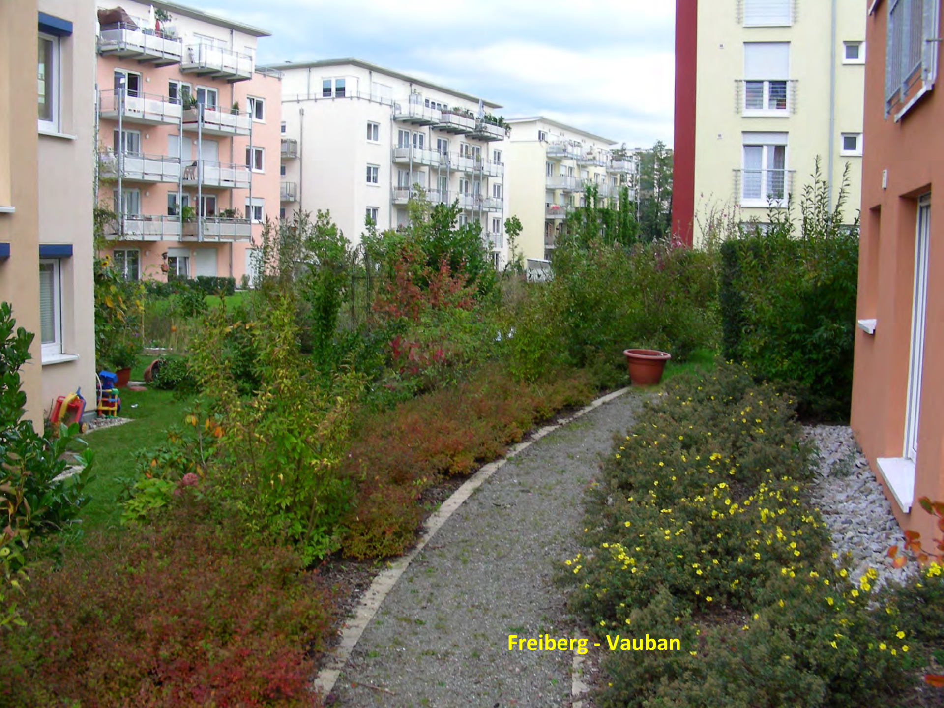
Freiberg - Vauban