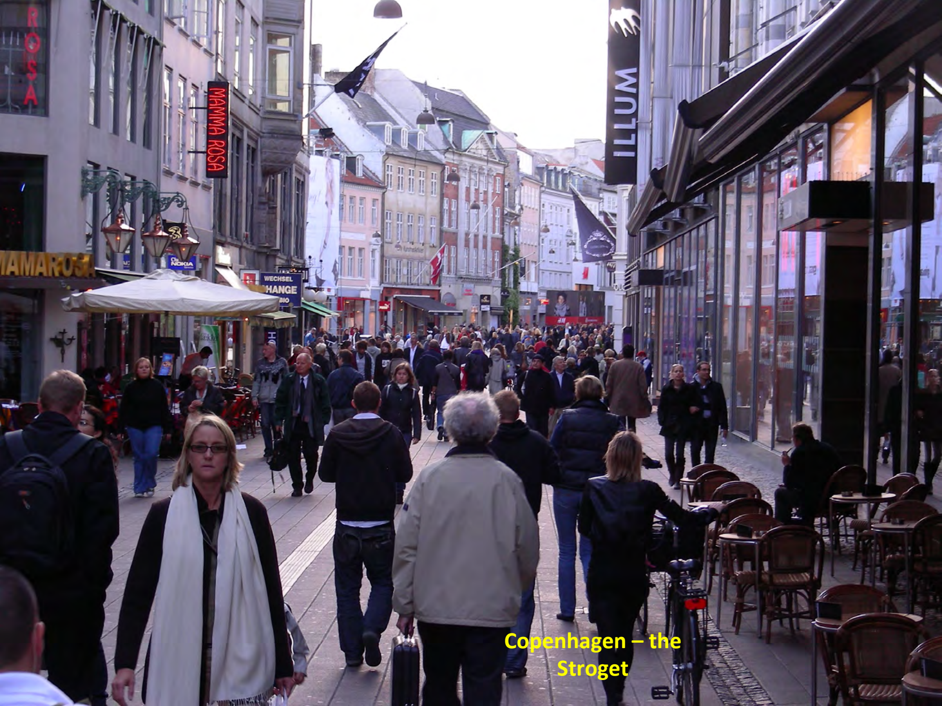
Copenhagen – the Stroget