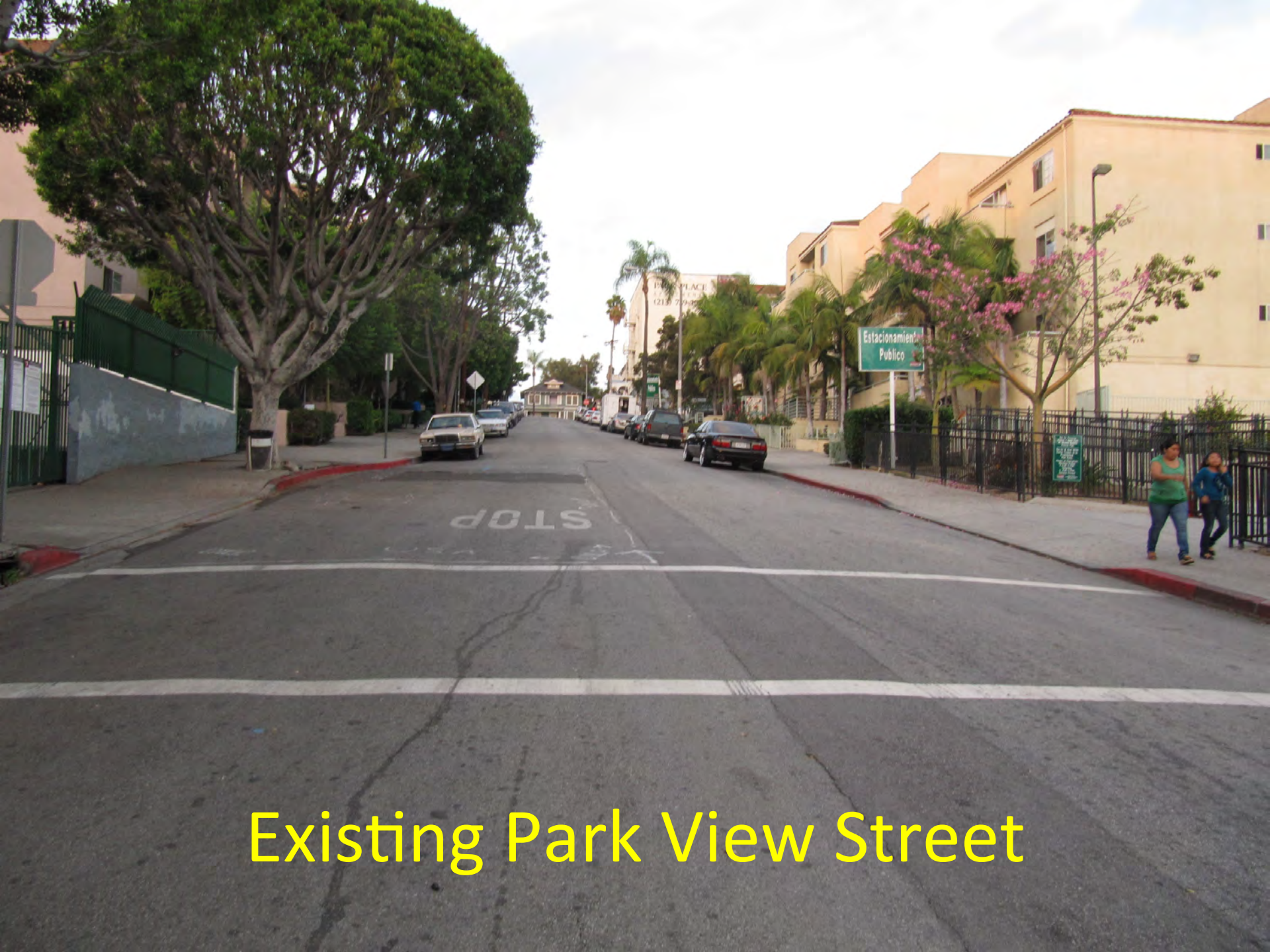
Existing Park View Street