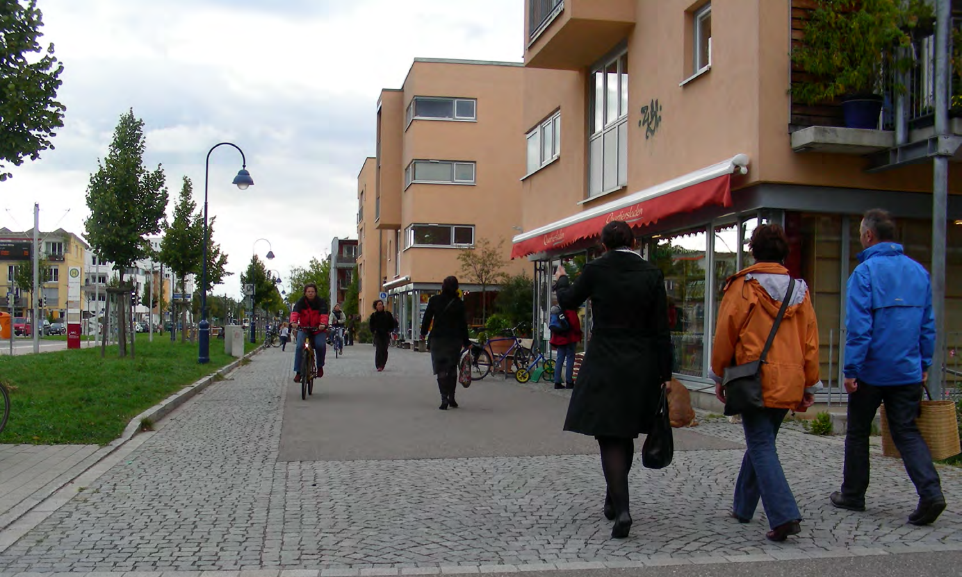
Freiberg - Vauban