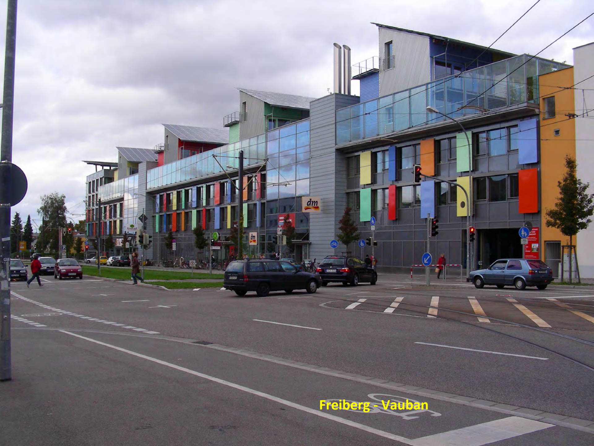
Freiberg - Vauban