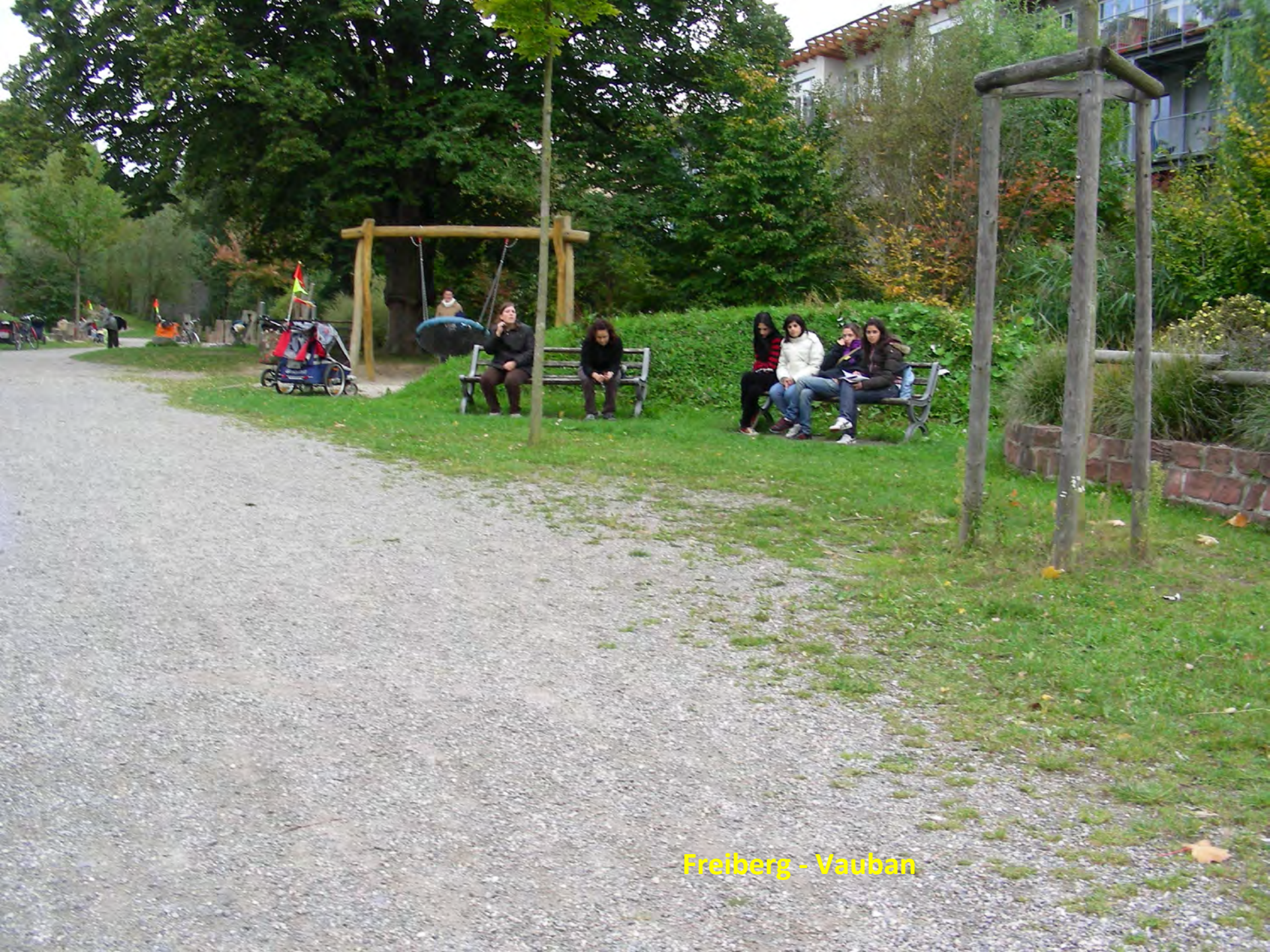
Freiberg - Vauban