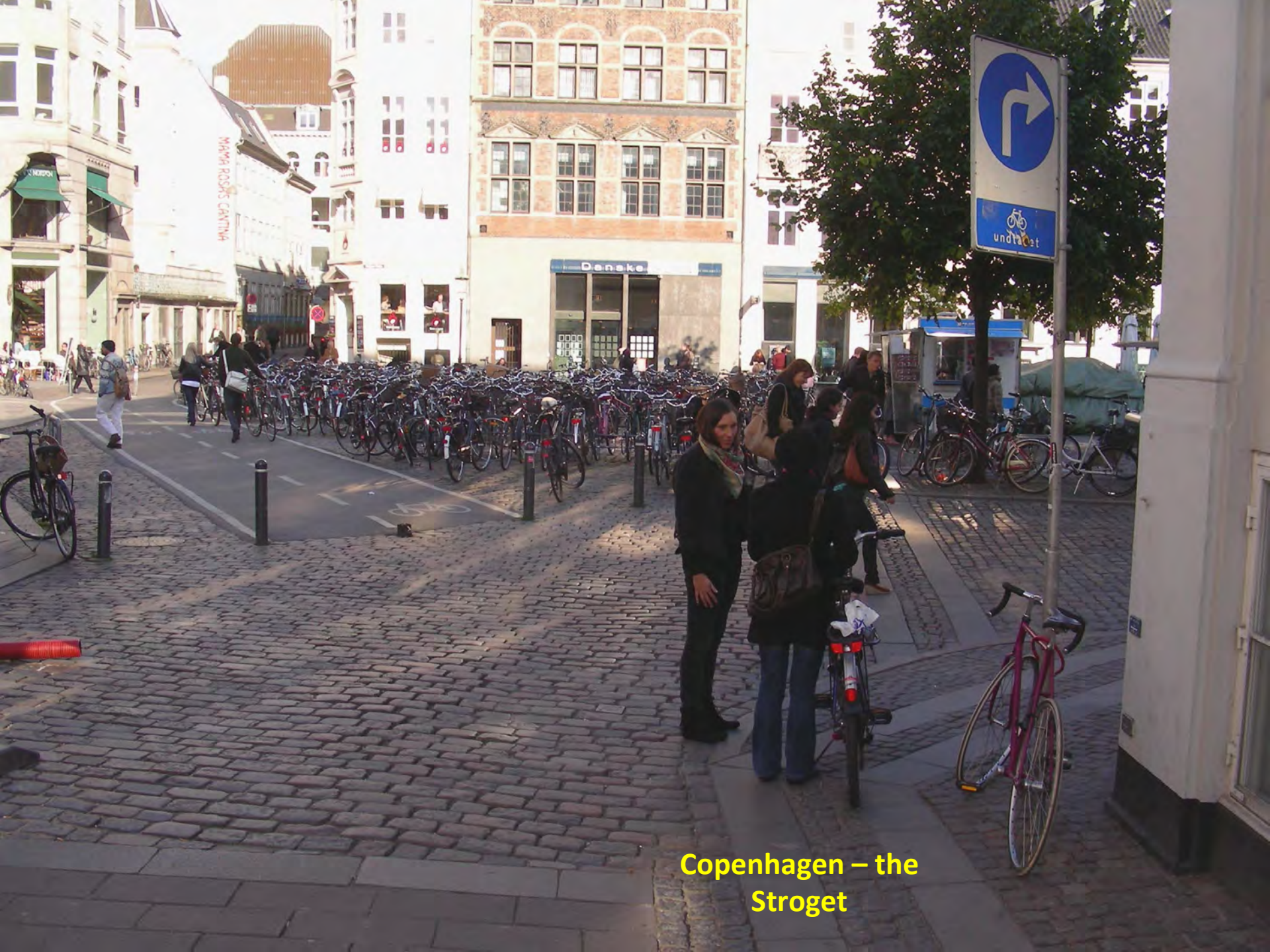
Copenhagen – the Stroget